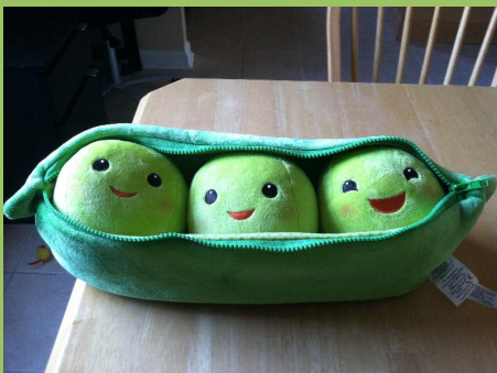
Prue, Piper, and Penny Pea