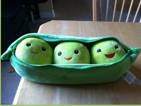
Prue, Piper, and Penny Pea

Prudence, and Penelope peas. Each week these three peas will be playing hide and seek at our market. Come to the Market Manager's Booth and let us know where to find each of them for a prize reward!